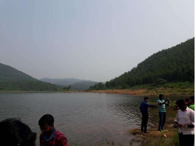
Splendid Burudi Lake Surrounded by the beautiful Dalma Hills