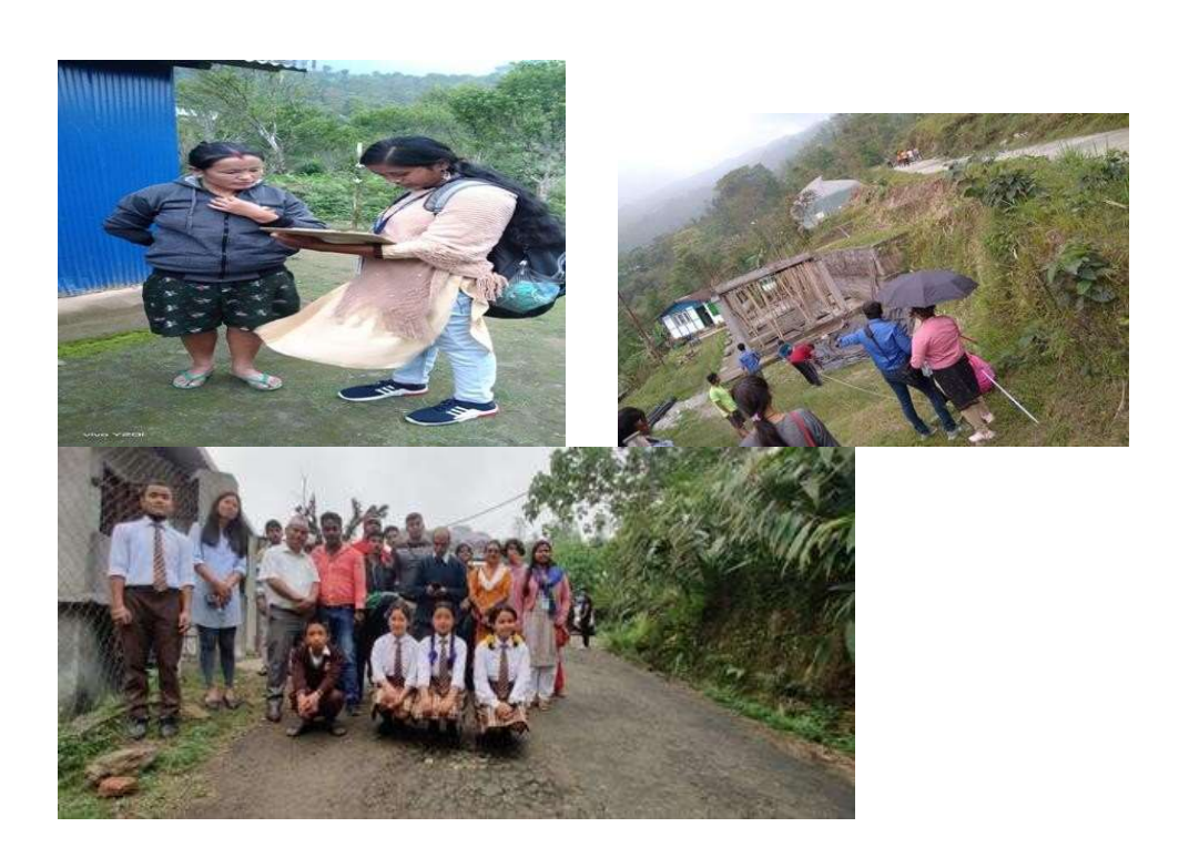
Excursion: Sittong, Kurseong, WB