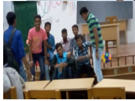
Post Graduated Govt. Institute for Physical Education,Banipur(Seminar Hall)