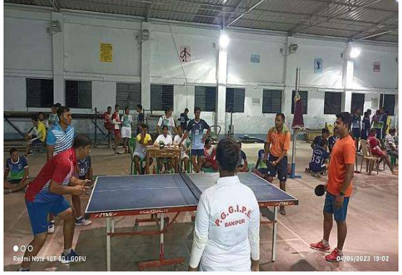
Practice Table Tennis (the students of P.G.G.I.P.E)