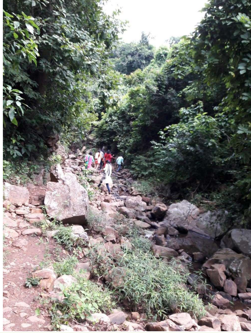
BOTH STUDENTS AND TEACHERS CROSSING STONY PATH THAT ENDS AT A WATERFALL