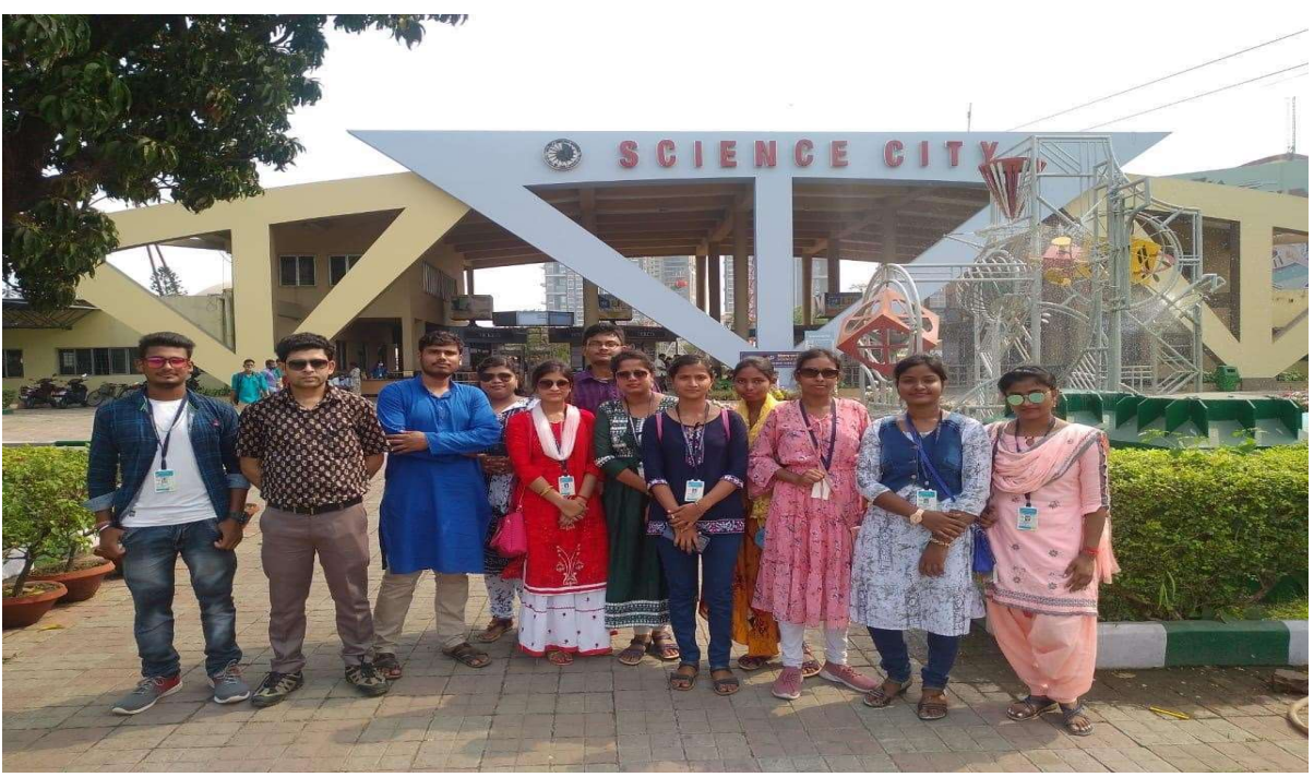
Department of Education in front of science City. April,2,2022.

education institutions there such as Amity University, Sister Nivedita University and Ramakrishna Mission Research Centre at NewTown. In the end, they visited Eco Park and stayed there till 5:00 P.M. and returned Udaynarayanpur at 7:30 P.M. safely.