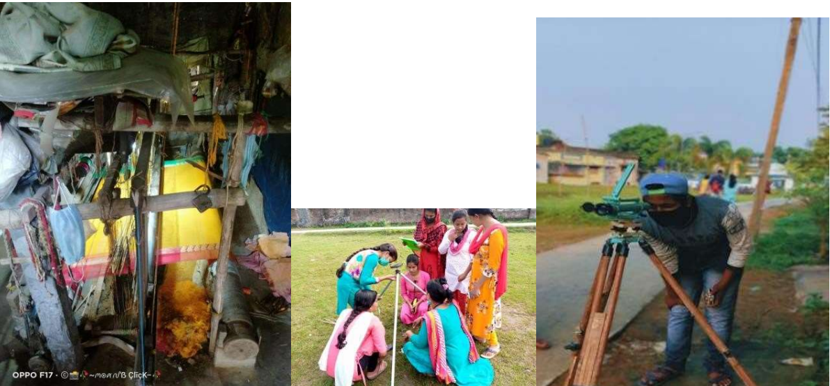
Rajbalhat Gram Panchayet, Hooghly District, West Bengal., 2021