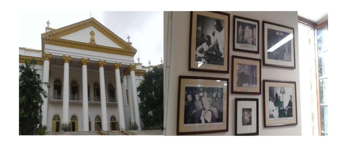
It was a grand opportunity to visit the Governor's Office where the new Chief Minister takes his or her oath after winningthe election.

Inside the Palace we also observed the Central Library which was the enormous stock of unavailable pieces of valuable books and from where we came to know many unknown information regarding the evolution of the Indian Constitution and also found the original Indian Constitution.