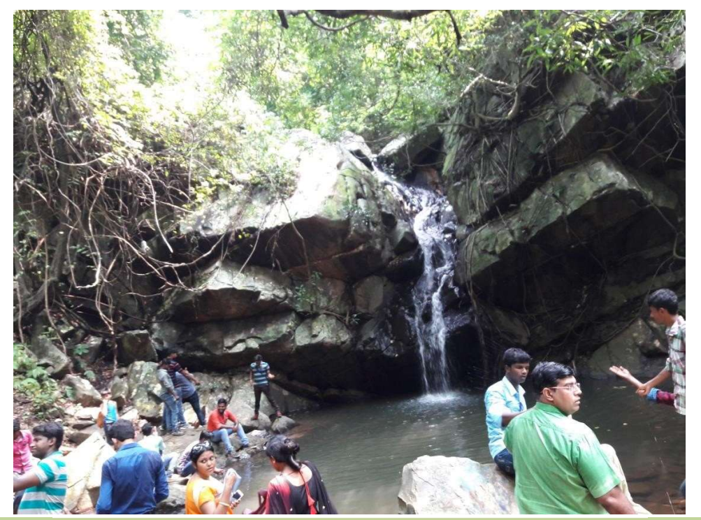
BOTH STUDENTS AND TEACHERS WATHING DHARAGIRI WATERFALL